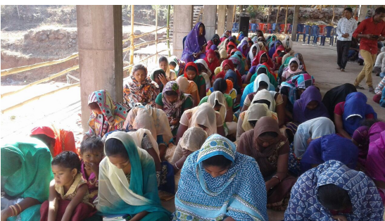
Women praying in India