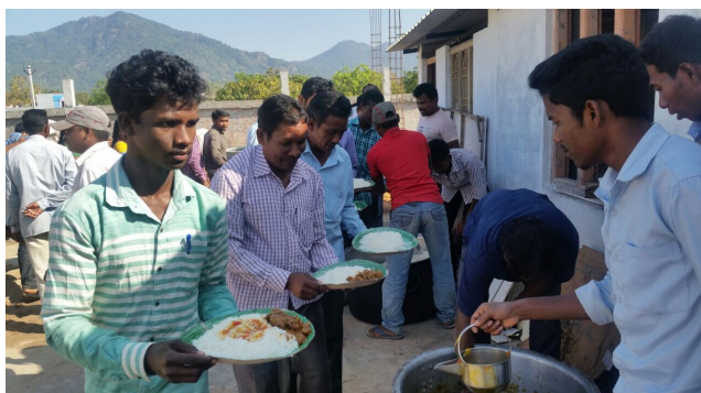
Feeding the hungry....